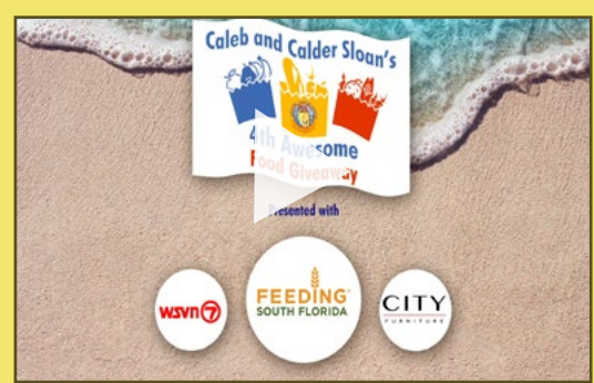
PLAY BROWARD COUNTY EVENT COVERAGE