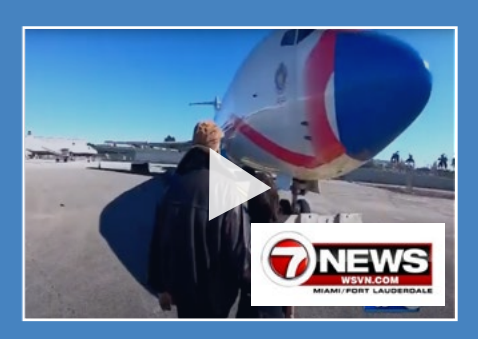
PLAY WSVN STORY