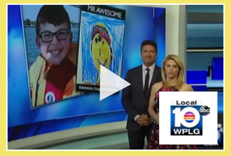
PLAY WPLG STORY