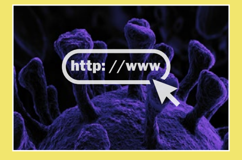
PLAY CAMPAIGN OVERVIEW