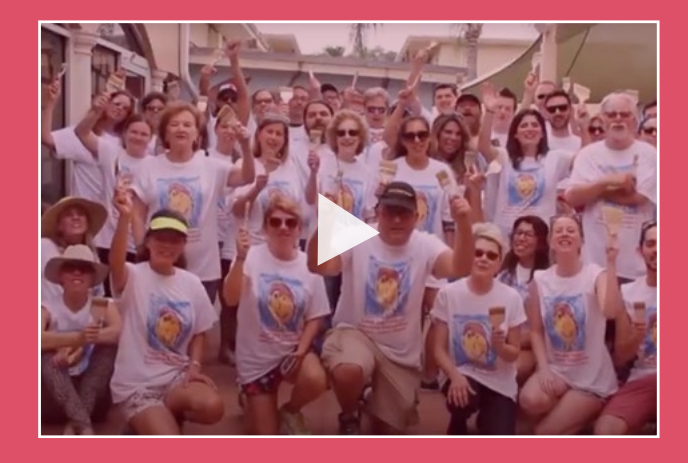
PLAY FOUNDATION OVERVIEW VIDEO

Our mantra: Adventure, Laughter and Kindness