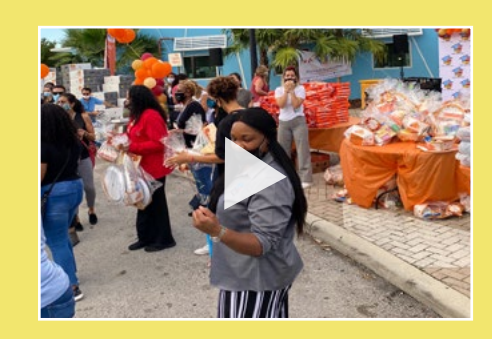
PLAY THANKSGIVING EVENT VIDEO