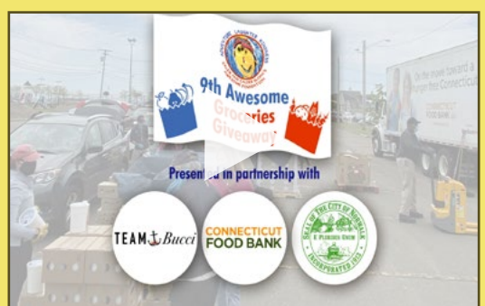
PLAY NORWALK CONNECTICUT EVENT COVERAGE