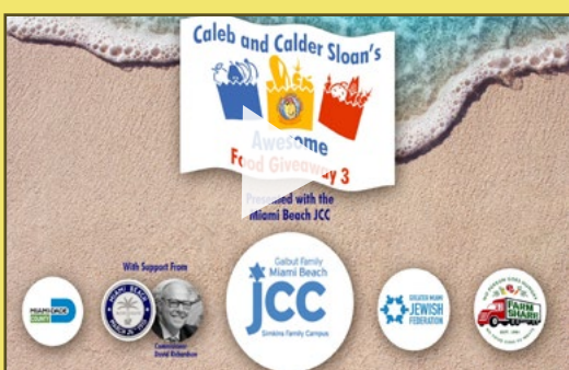
PLAY MIAMI JCC EVENT SIZZLE VIDEO