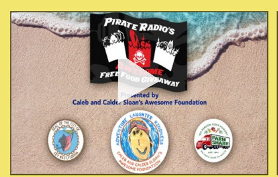
PLAY PIRATE RADIO KEY WEST EVENT SIZZLE VIDEO