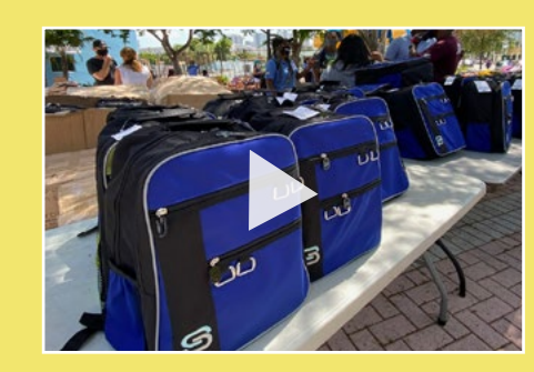
PLAY BACK TO SCHOOL EVENT VIDEO